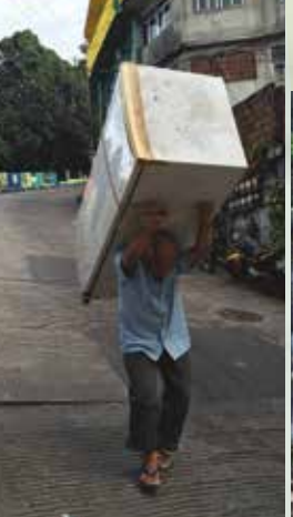
Not the easiest way to transport a fridge!